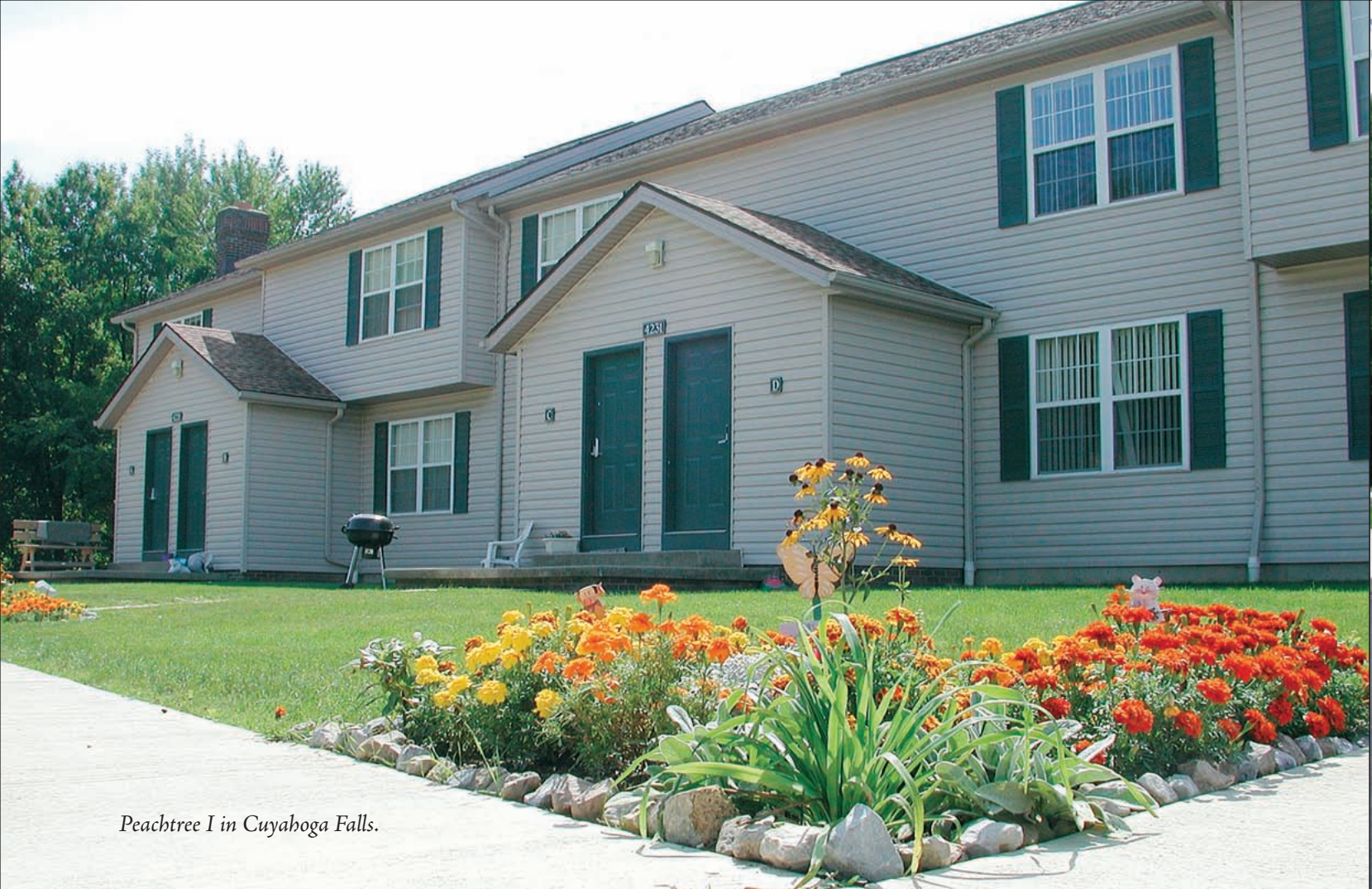
Peachtree I in Cuyahoga Falls.