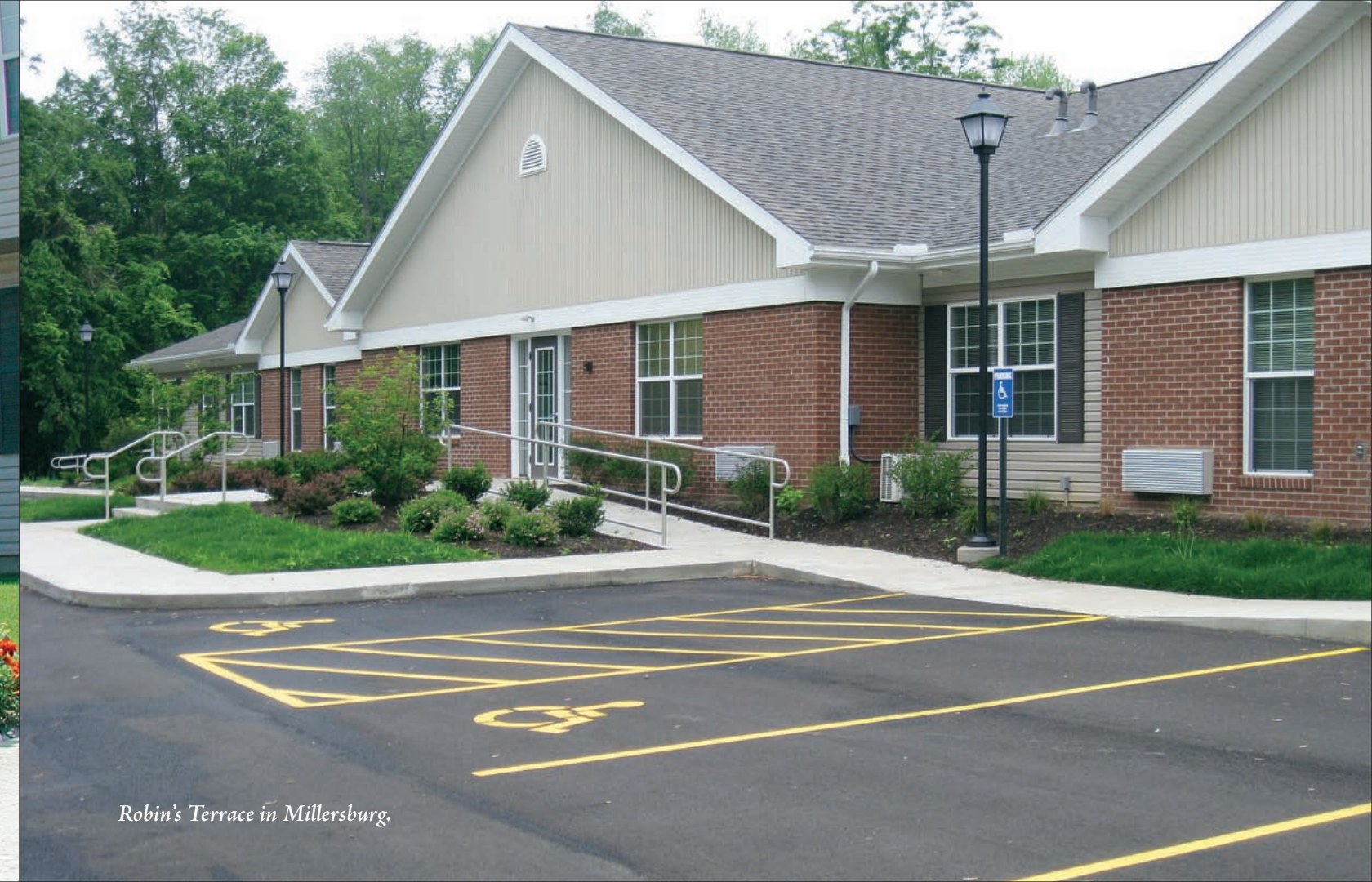
Robin's Terrace in Millersburg.